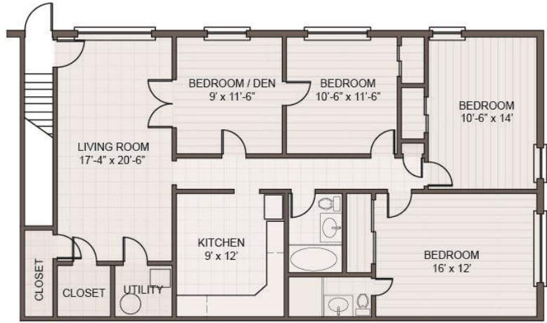
"D" Style Apartment Approximately 1200 square feet. Maximum Occupancy 5 persons.