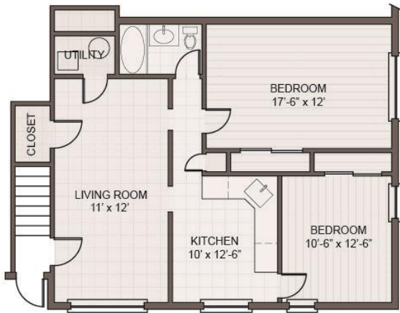
"B" Style Apartment Approximately 900 square feet. Maximum Occupancy 3 persons.