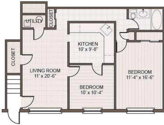
"A" Style Apartment Approximately 700 square feet. Maximum Occupancy 3 persons.